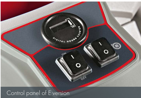
Control panel of E version