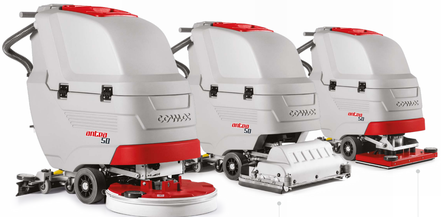
ANTEA 50 E/B/BT Scrubbing version with disc brush