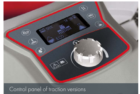
Control panel of traction versions

The simple control panel of (Antea 50 E/B) favours an intuitive use.