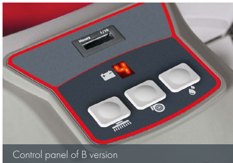
Control panel of B version